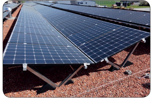
Mounted photovoltaic panels prior to the establishment of the seed mix vegetation.